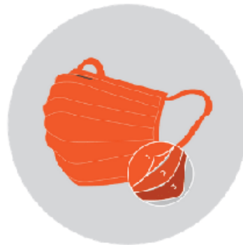
Have 2 or more layers