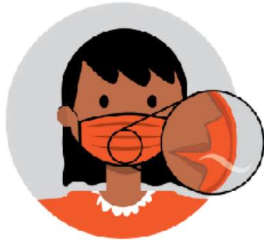
Allow you to breathe