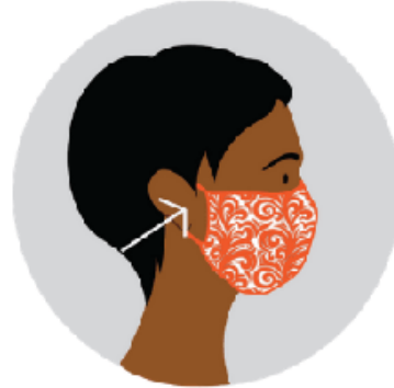
Fit snugly with no large gaps